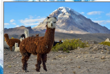
Sajama – 6.542 m

We climb 8 summits, thereof three > 5 k and five > 6 k meters.