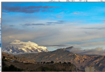
Illimani – 6.438 m